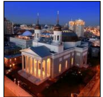
Basilica of the Assumption, America's First Cathedral