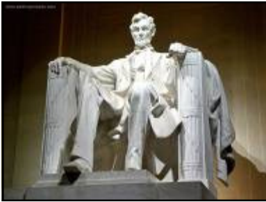
The Lincoln Memorial

St. Matthew's Cathedral , a magnificent Romanesque basilica that is the cathedral church of the Washington Archdiocese.