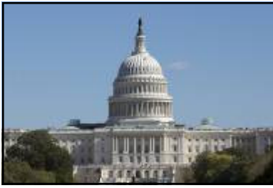
The U.S. Capitol

The itinerary and prospective sites are still in development, but may include: