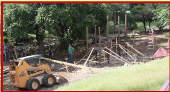
The large playscape is taking shape.

We're currently finishing the concession stand and storage facility on the ball field. The structure measures 24x30.