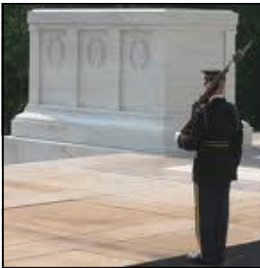
Tomb of the Unknowns

Old Town Alexandria . Another 17 th century English colonial city, Alexandria predates by 200 years the founding of the nearby national capital of Washington, D.C., which was not created until the Federal period. Many colonial era buildings remain intact. We will visit and perhaps have Mass at Old Saint Mary's, the oldest Catholic church in Virginia, dating from the 18 th century.