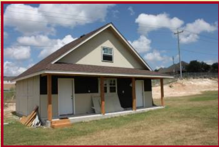
Concession stand and storage facility in process

We're currently finishing the concession stand and storage facility on the ball field. The structure measures 24x30.