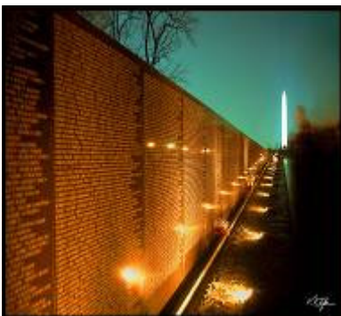
The Vietnam Memorial